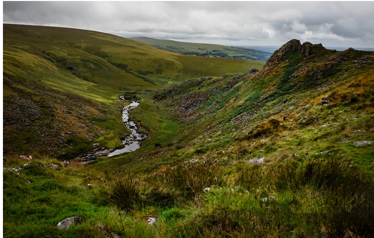
Middle Tavy Cleave