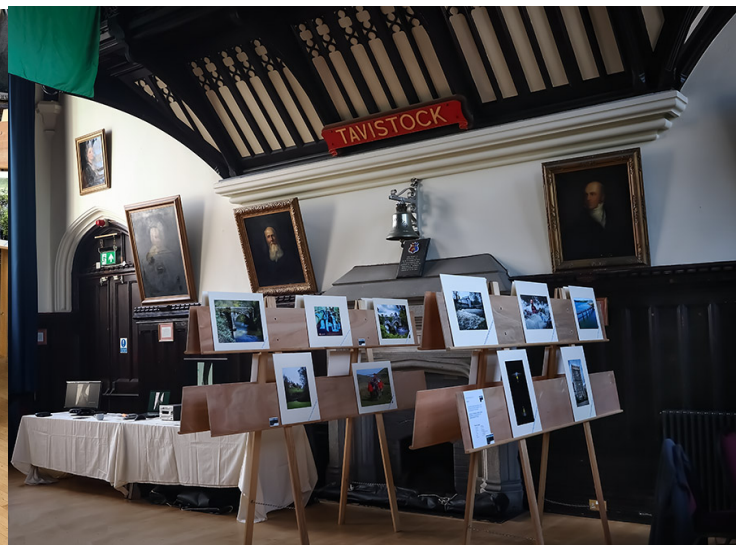
All set up